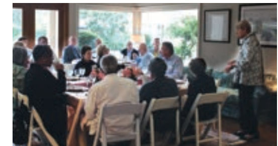
The Sullivan Home Salon, April 30, 2023