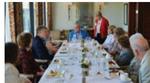
Annandale Golf Club Salon, July 9, 2023