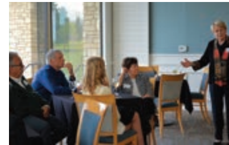
Brentwood Country Club Salon, May 18, 2023